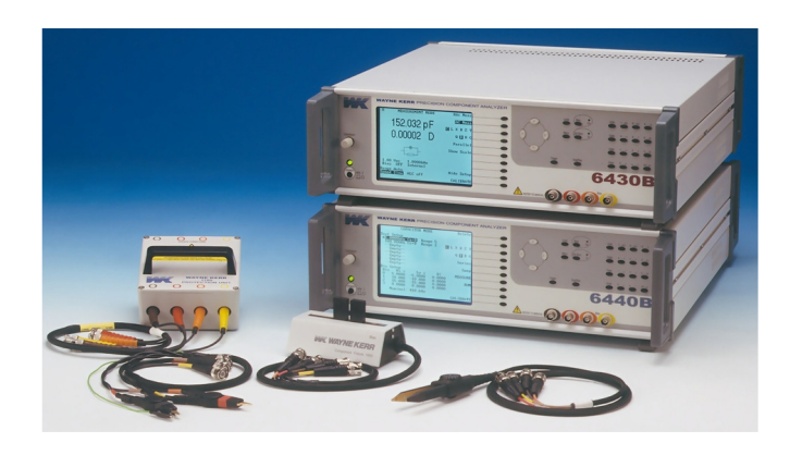
Accurate component analysis to 500 kHz (6430B) or 3 MHz (6440B) is simplified by many accessories which includes Overload Protection Unit 1J1100

The protection unit will protect the test equipment from up to 25 Joules of charged energy.