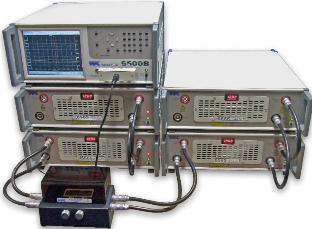
Typical 120 MHz 40 A DC Bias Current System (using 65120B, 4 x 6565-120 and 1027 Fixture)